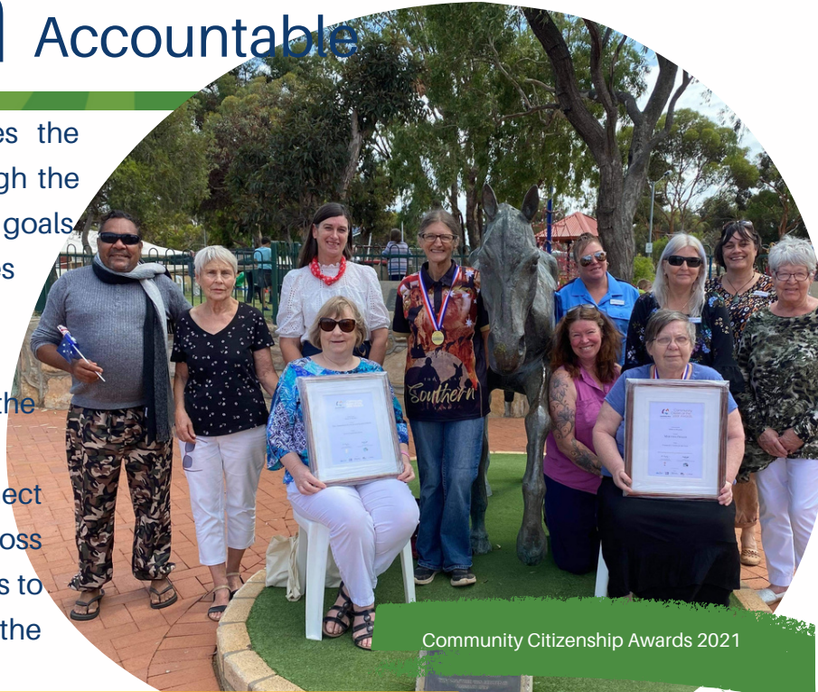
Community Citizenship Awards 2021

The strategies are designed to interconnect so that they support good outcomes across the Shire's activities. The program of works to deliver the strategies will be detailed in the Corporate Business Plan.