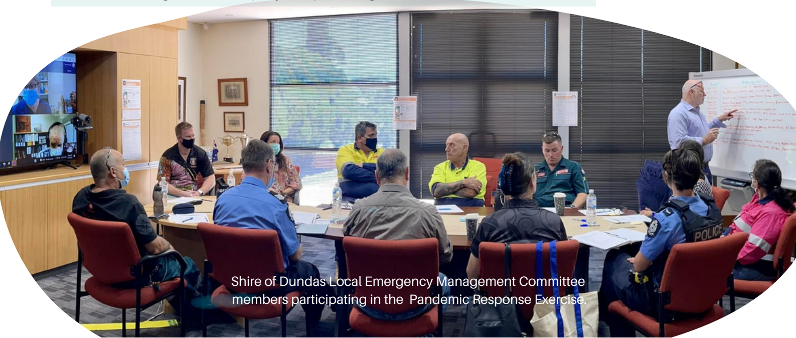
Shire of Dundas Local Emergency Management Committee members participating in the Pandemic Response Exercise.