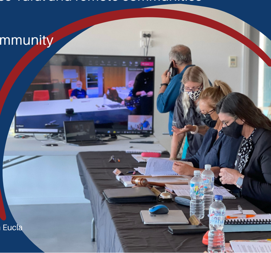
Ordinary Council Meeting in Eucla