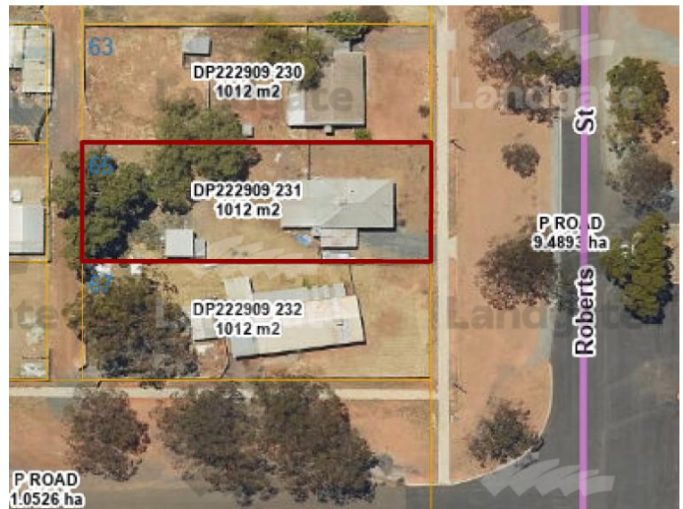
Figure 2 – Aerial photo of lot 231

The application for development approval states that approval is sought for a proposed carport, however, as the proposed carport is shown with a front wall incorporating a roller door that is not visually-permeable (ie. it can't be seen through) the proposed structure is deemed a 'garage' pursuant to State Planning Policy (SPP) 7.3—Residential Design Codes of Western Australia Volume 1 (the 'R-Codes' ).