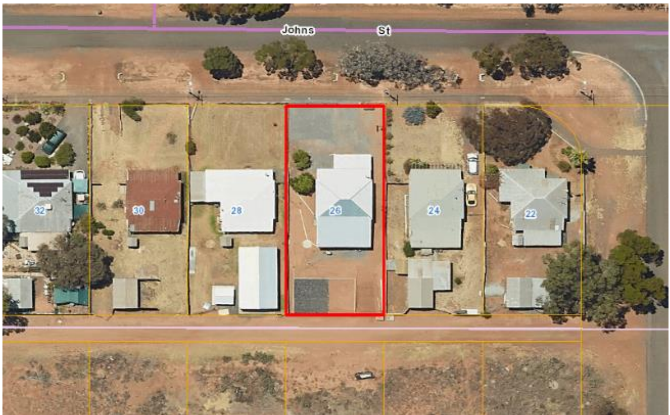
Above: Location Plan

The subject land is located near the corner of Johns Street and Gregory Street. There is a laneway to the south which provides access to the rear of the subject lot.