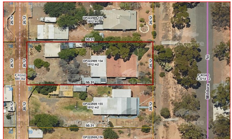
Figure 2 – Aerial photo of lot 154