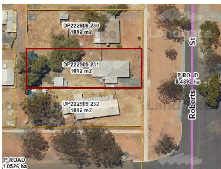
Figure 2 – Aerial photo of lot 231

The application for development approval states that approval is sought for a proposed carport, however, as the proposed carport is shown with a front wall incorporating a roller door that is not visually-permeable (ie. it can't be seen through) the proposed structure is deemed a 'garage' pursuant to State Planning Policy (SPP) 7.3—Residential Design Codes of Western Australia Volume 1 (the 'R-Codes' ).