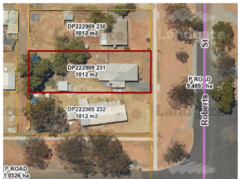
Figure 2 – Aerial photo of lot 231

The application for development approval states that approval is sought for a proposed carport, however, as the proposed carport is shown with a front wall incorporating a roller door that is not visually-permeable (ie. it can't be seen through) the proposed structure is deemed a 'garage' pursuant to State Planning Policy (SPP) 7.3—Residential Design Codes of Western Australia Volume 1 (the 'R-Codes' ).