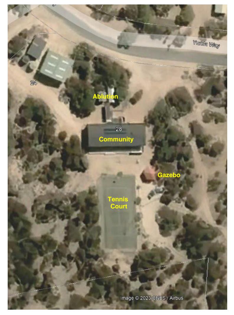
Figure 2 – Site of Eucla's Civic, Community and Recreational Facilities

Figure 2 underneath denotes an aerial image of the subject land.