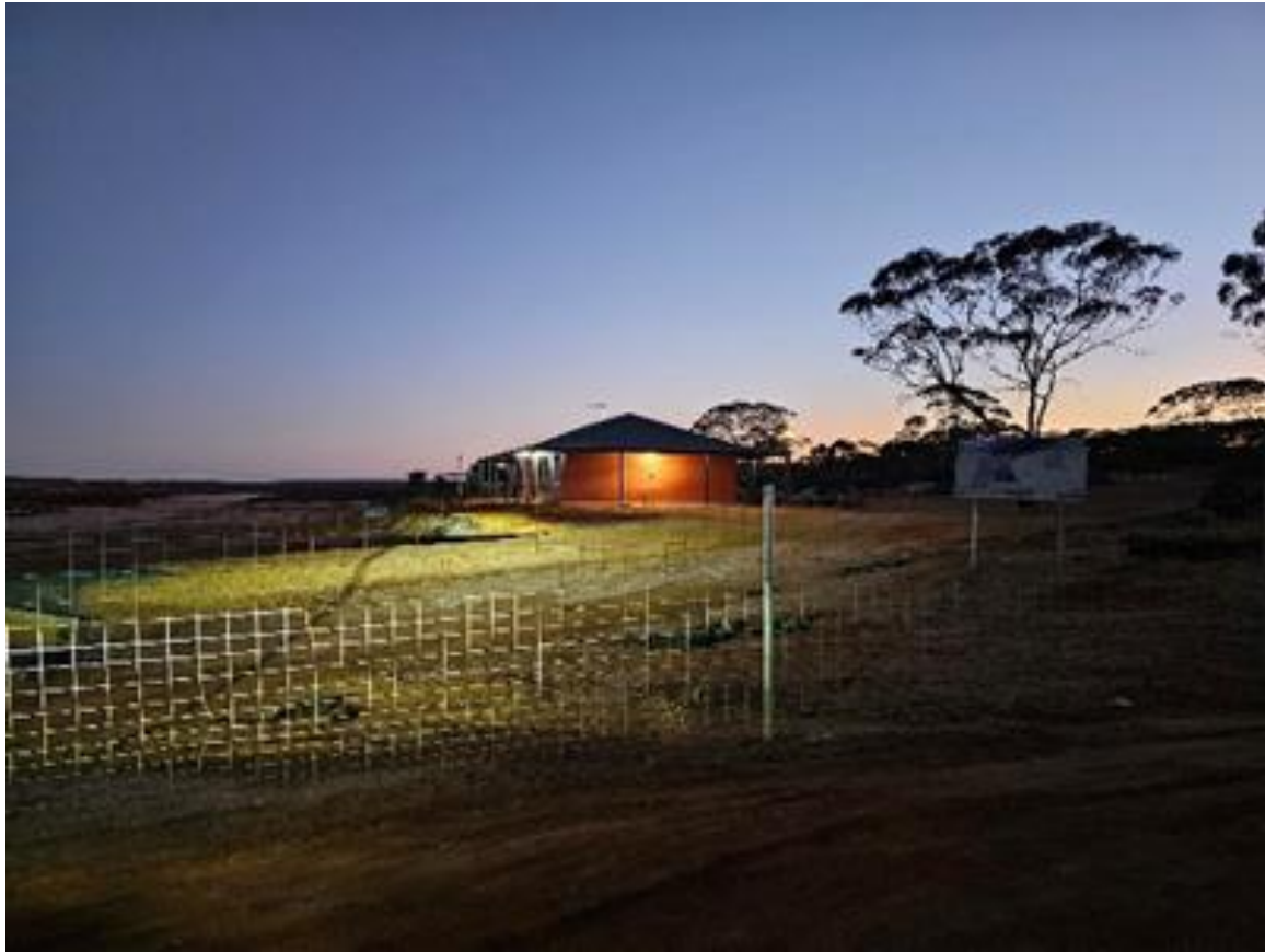
AIRPORT TERMINAL BUILDING WITH POWER CONNECTED